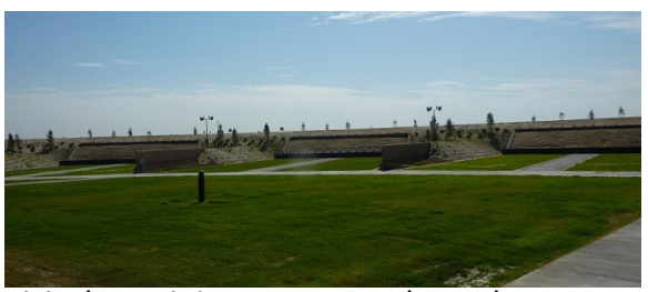
Visit the training center on the web at: http://www.fresnopolice.net/